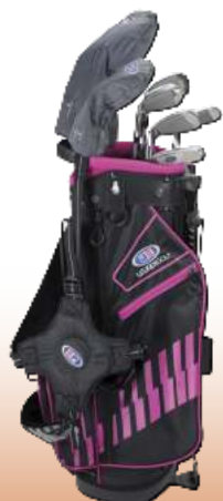
PINK BAG OPTION 17763 (F) 6-Club DV3 Stand Bag Set