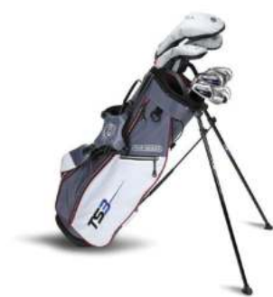
LH TS3-60 11 Club Stand Set (60443)