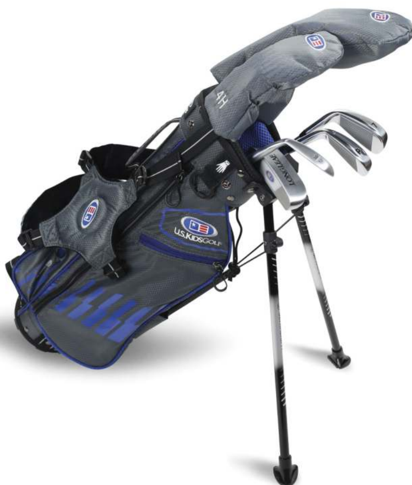
STANDARD BAG OPTION 17762 (F)-(RIGHT HAND) & 17862 (F)-(LEFT HAND) 6-Club DV3 Stand Bag Set