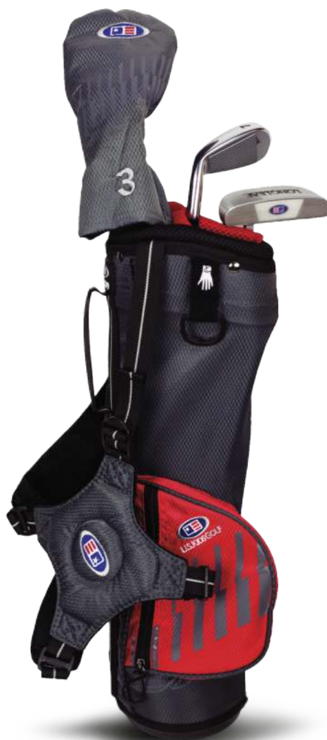
CARRY BAG OPTION - 13760 (F) 4-Club Training Club Carry Bag Set