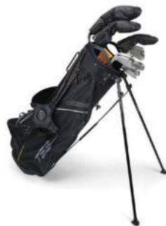
LH TS3-63 11 Club Stand Set (63445)

V5 (5% LIGHTER THAN ADULT CLUBS) OPTIMAL HEIGHT RANGE: 63" to 66" DRIVER LENGTH: 42" TYPICAL AGE RANGE: 11 to 13 DRIVER SWING SPEEDS 75 MPH AND OVER