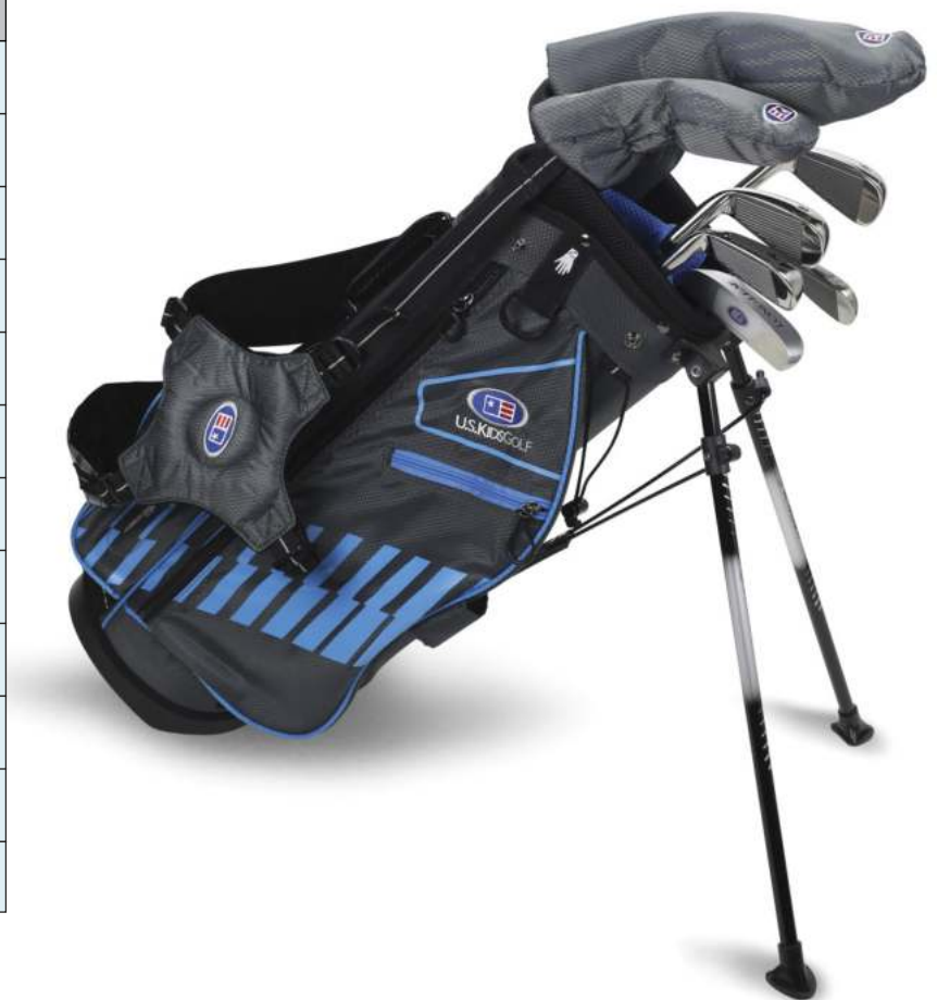
STANDARD BAG OPTION 18763 (RIGHT HAND) - 18863 (LEFT HAND) 7-Club DV3 Stand Bag Set