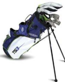
TS3-57 11 Club Stand Set (57043)

V10 (10% LIGHTER THAN ADULT CLUBS) OPTIMAL HEIGHT RANGE: 57" to 60" DRIVER LENGTH: 38" TYPICAL AGE RANGE: 9 to 11 DRIVER SWING SPEEDS 65 MPH AND OVER