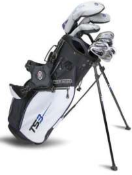
LH TS3-54 11 Club Stand Set (54963)