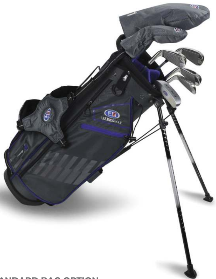
STANDARD BAG OPTION 23762 (F-RIGHT HAND) - 23862 (F-LEFT HAND) 7-Club DV3 Stand Bag Set