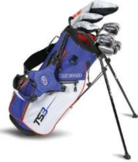
LH TS3-51 11 Club Stand Set (51963)