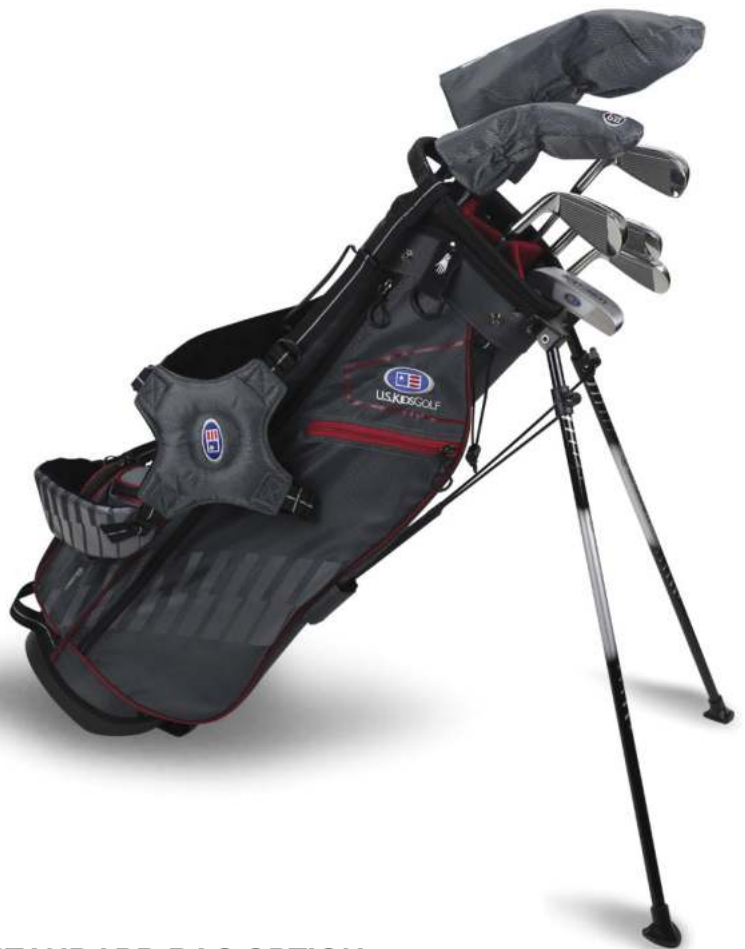
STANDARD BAG OPTION 27762 (F-RIGHT HAND) - 27862 (F-LEFT HAND) 7-Club DV3 Stand Bag Set