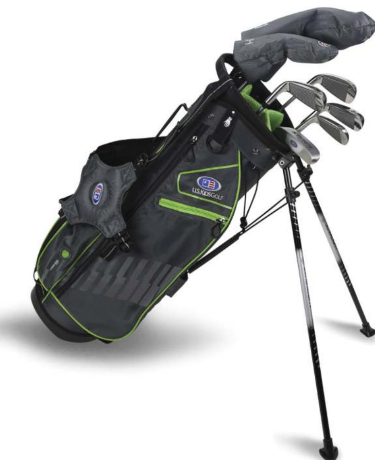
STANDARD BAG OPTION 24762 (F-RIGHT HAND) - 24862 (F-LEFT HAND) 7-Club DV3 Stand Bag Set