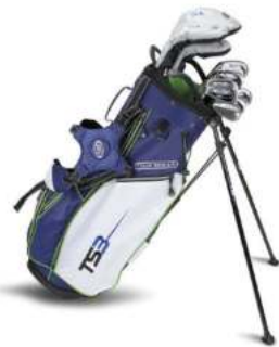
LH TS3-57 11 Club Stand Set (57443)