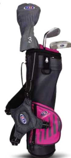
PINK BAG OPTION 13762 (F) 4-Club Carry Bag Set