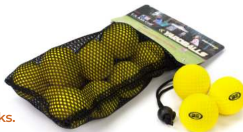
Additional Yard Balls sold in dozen packs.