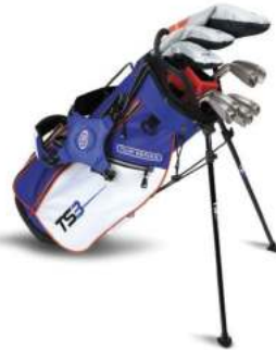
TS3-51 11 Club Stand Set (51063)

V15 (15% LIGHTER THAN ADULT CLUBS) OPTIMAL HEIGHT RANGE: 51" to 54" DRIVER LENGTH: 34" TYPICAL AGE RANGE: 7 to 9 DRIVER SWING SPEEDS 55 MPH AND OVER