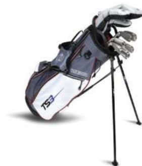
TS3-60 11 Club Stand Set (60043)

V5 (5% LIGHTER THAN ADULT CLUBS) OPTIMAL HEIGHT RANGE: 60" to 63" DRIVER LENGTH: 40" TYPICAL AGE RANGE: 10 to 12 DRIVER SWING SPEEDS 70 MPH AND OVER