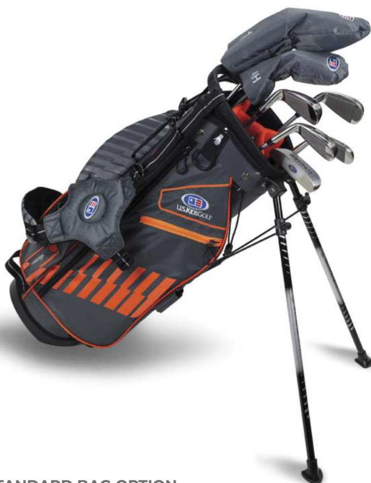
STANDARD BAG OPTION 19763 (F-RIGHT HAND) - 19863 (F-LEFT HAND) 7-Club DV3 Stand Bag Set