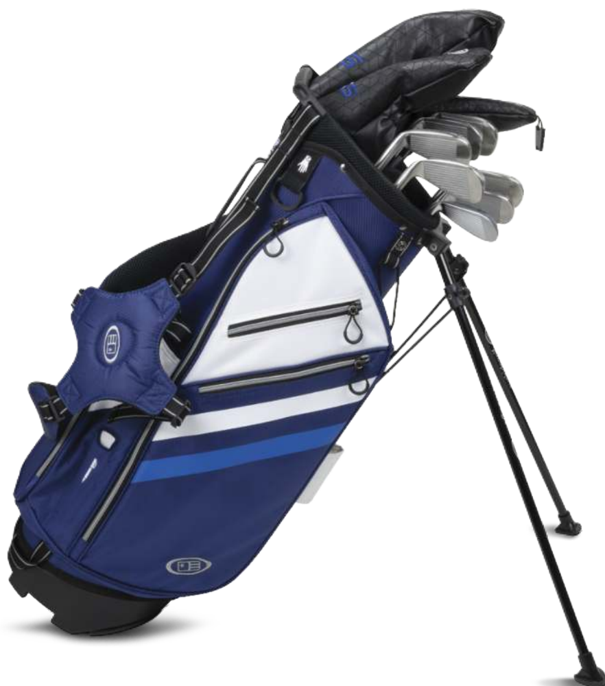
NAVY BAG OPTION 11 Club Stand Set RIGHT HAND (F) - (15102) LEFTY HAND(F) - (15152)