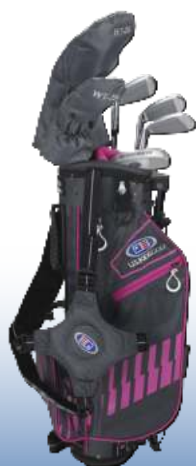
PINK BAG OPTION 17763 (F) 6-Club DV3 Stand Bag Set