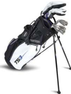
TS3-54 11 Club Stand Set (54063)

V10 (10% LIGHTER THAN ADULT CLUBS) OPTIMAL HEIGHT RANGE: 54" to 57" DRIVER LENGTH: 36" TYPICAL AGE RANGE: 8 to 10 DRIVER SWING SPEEDS 60 MPH AND OVER