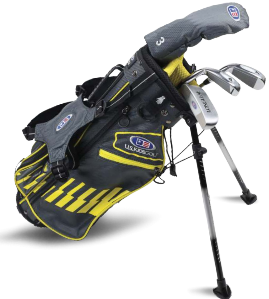
CARRY BAG OPTION 13760 (RIGHT HAND) - 13860 (LEFT HAND) 4-Club Training Club Carry Bag Set