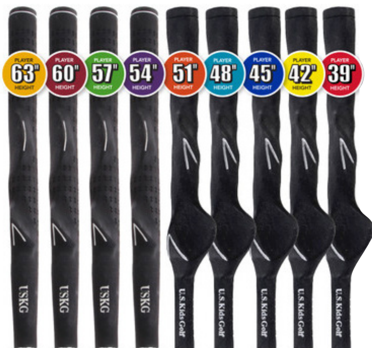
Molded training grips transition at player height 54"

With a molded grip that teaches proper hand placement, oversized head with a pitching wedge loft that helps get the ball in the air, and a flexible lightweight shaft that helps develop a proper swing, Yard Club can make learning easier and more fun. Use in the yard or when training with real golf balls at the range or golf course.